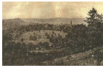
View of the landscape from Abberley Hill

Eighteen months ago we approached Natural England to see if we were eligible for funding. This was dependant on the ecological credentials of the grasslands within the