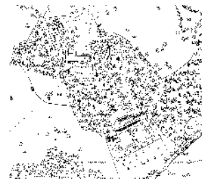
1884-5 County Series 1:2500